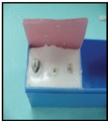
Figure 1. Alginate model.

Determination of actual length (AL): AL was measured by introducing a size 15 K-file (Dentsply, Switzerland) into each canal until the tip of the file was just visible at the main foramen using the microscope OMPI PICO (Carl Zeiss, Germany) under 2.5 \times magnification (from 0, 45 and 90 degree angle). Each measurement was repeated 3 times and an average was computed. Alginate model specially developed by Kaufmann et al. 9 for testing apex locators was used in this study. The model consisted of teeth embedded in alginate in a plastic box (Figure 1). The alginate model was kept moist in the refrigerator when not in use throughout the experiment. Pink wax was used to block an area next to the embedded teeth to accommodate placement of the radiographic digital sensor for taking radiographs.