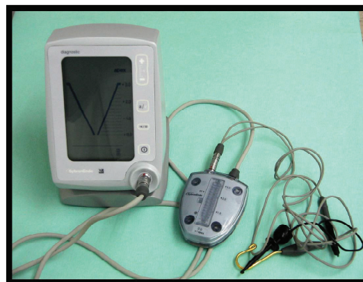
Figure 2. Elements apex locator.

Determination of electronic length (EL) in the presence of 2.5% NaOCl: All canals were irrigated with 15 ml 2.5% NaOCl solution. Excess solution in the canal was aspirated using the irrigating syringe and EL was taken again using both EALs. To prevent bias, measurement for all 30 teeth was done at a random order.