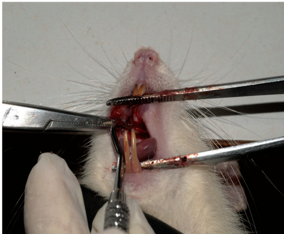
Figure 1. Assisted drainage therapy in Wistar rat