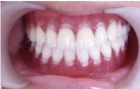
Figure 4 Conventional complete denture on the maxilla and mandible implant-retained overdenture with magnets