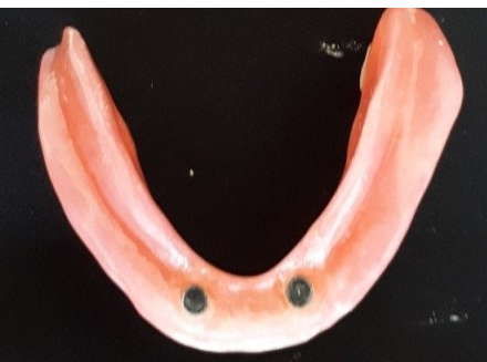
Figure 5 Two magnets bonded to the mandible overdenture

attached more efficient to obtain retention and stability of denture teeth. 7-9