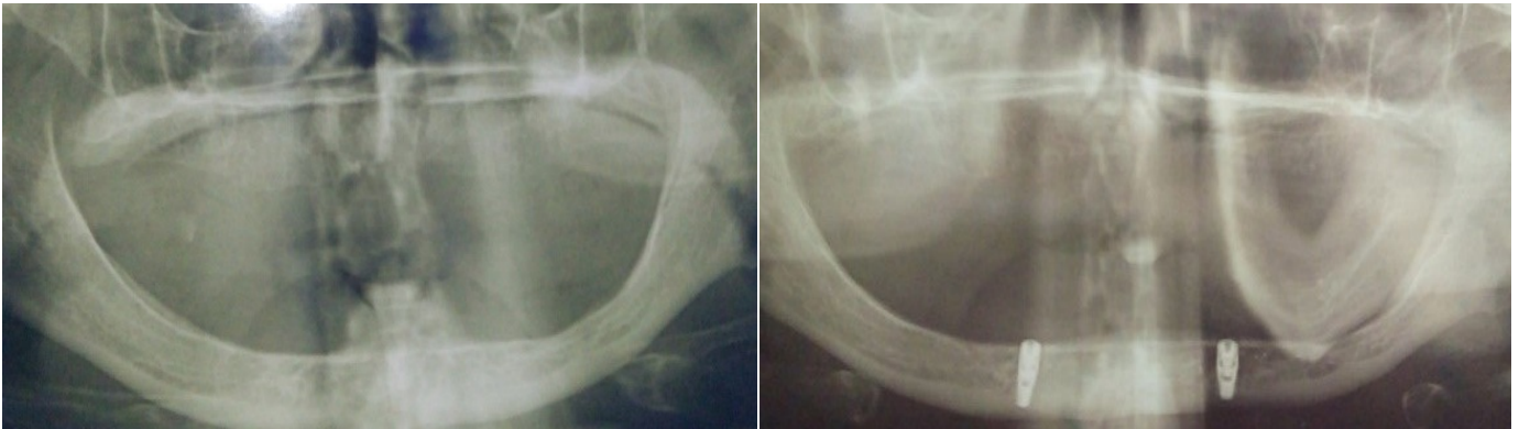
Figure 2 Findings on a panoramic radiograph obtained before implant treatment