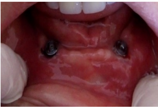
Figure 3 Two magnetic attachment supported by two implants